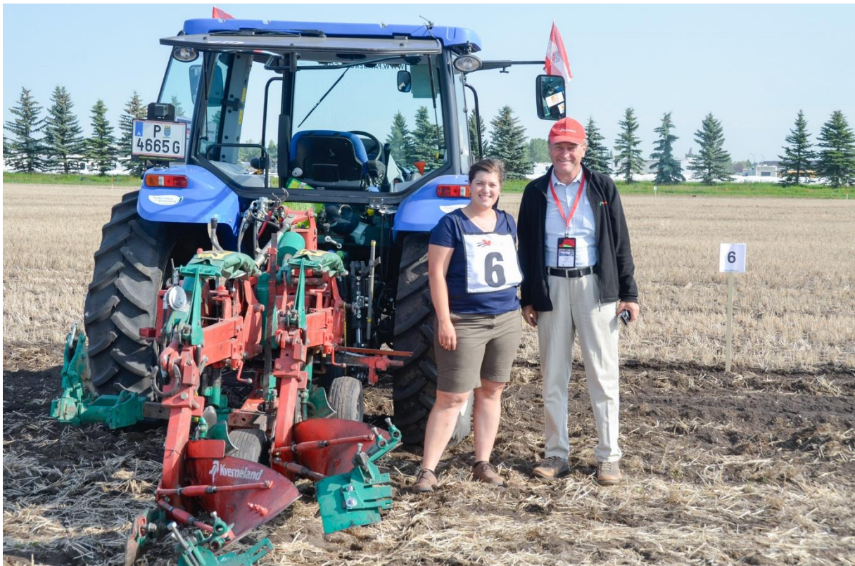
Wpc Canada 2013