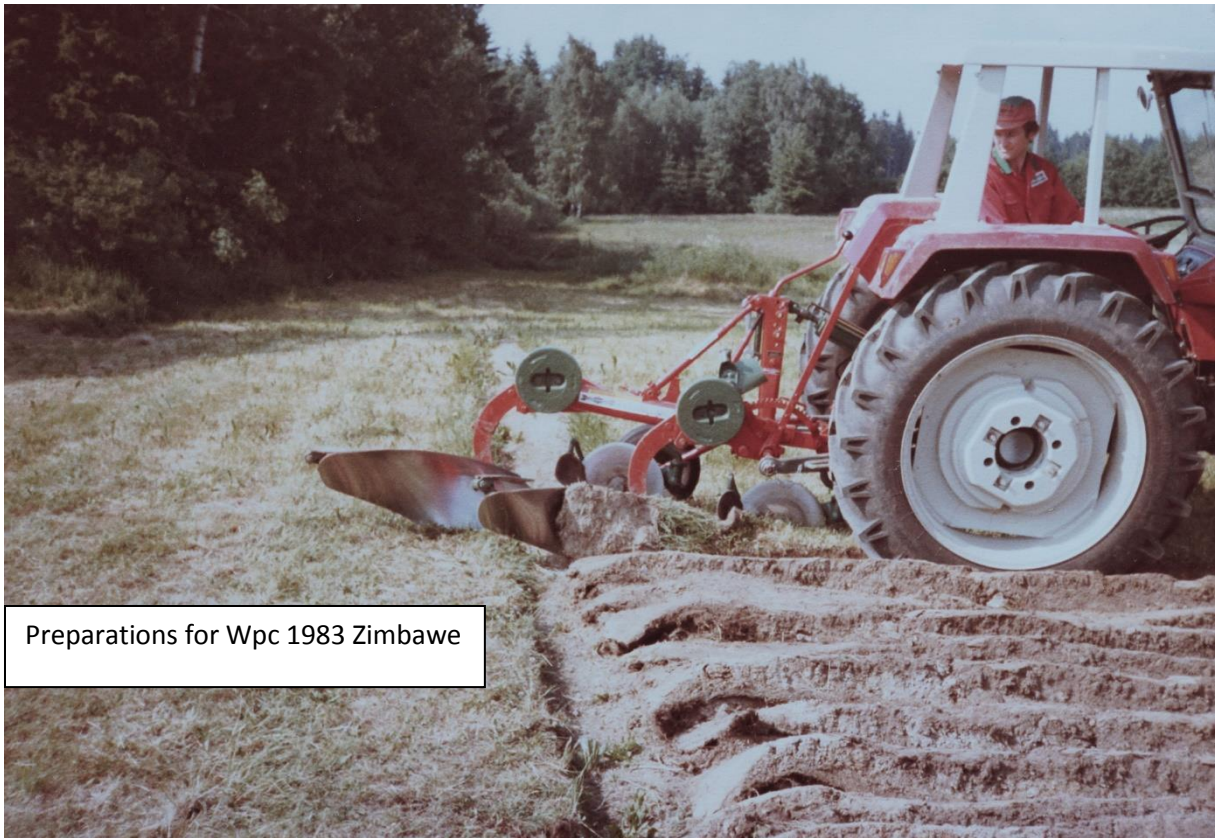
Preparations for Wpc 1983 Zimbabwe