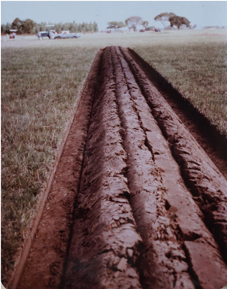
Official grassland practice Zimbabwe 1983