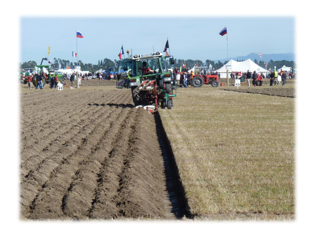
August 29th - September 8th 2014