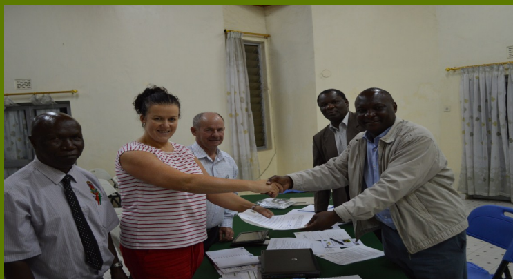
Signing WPO Contract for Kenya 2017

The Kenyan Ploughing Association will confirm later when they plan to include tours - before or after the contest programme. Visitors will have the opportunity to extend their trip to include Safari or Beach Holidays.