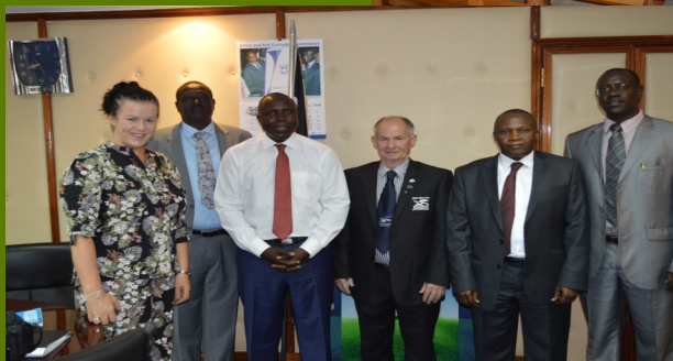
Meeting Kenyan Minister for Agriculture