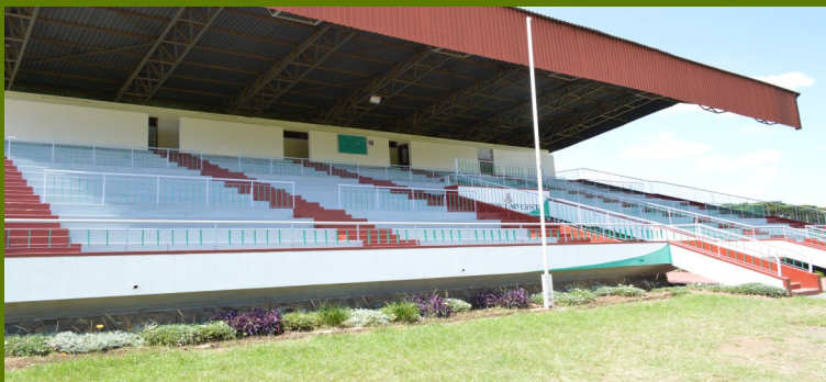
Egerton University—Venue for Opening / Closing Ceremony

Will take place very close to the ARC building and just yards away from the Marshalling Yard. The Opening will happen on the eve of the World Contest and it is hoped that the President of Kenya will attend.